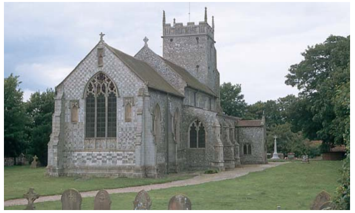
All Saints' Church, Burnham Thorpe

20 At the X-roads with the B1105, go SA (NS).