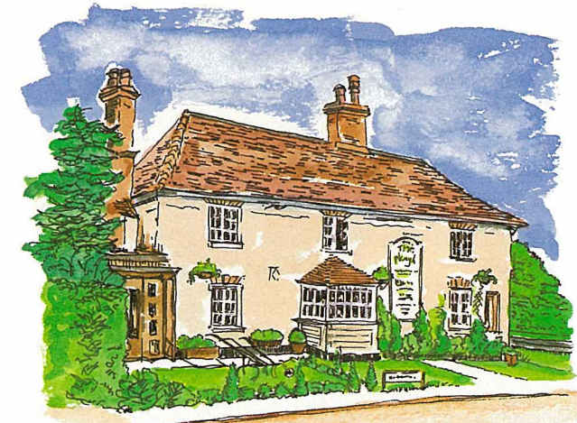
The Plough at Coton